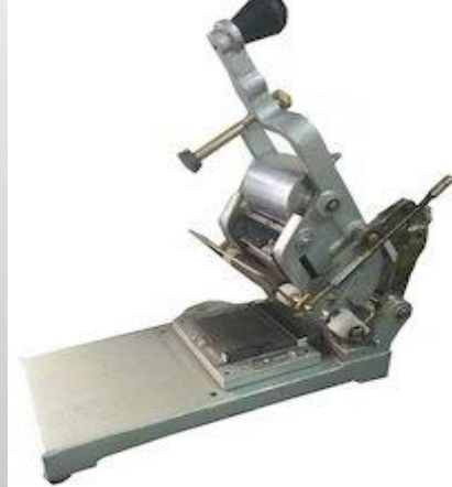
Batch Printing Machine