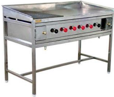
Chapatti Plate Cum Puffer