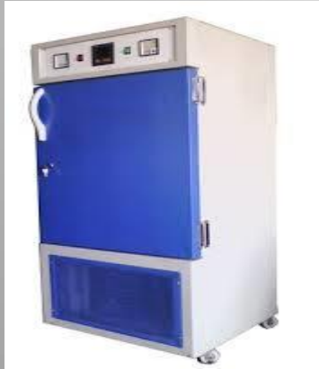
B. O.D Incubator