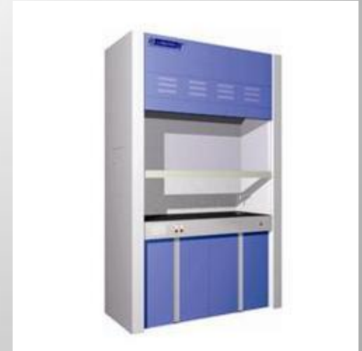
Fume Hood – for chemicals