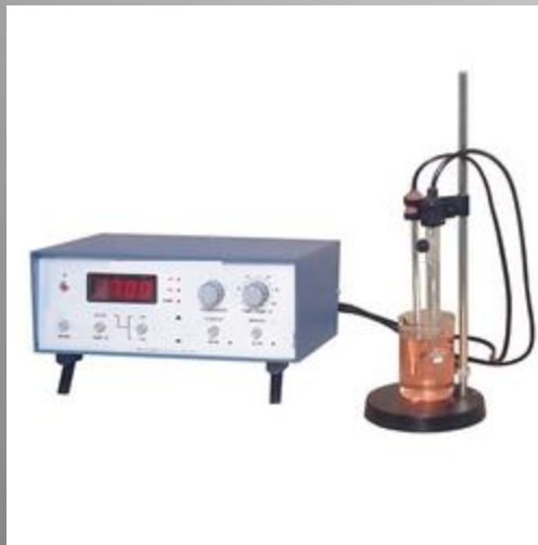
Digital PH Meter