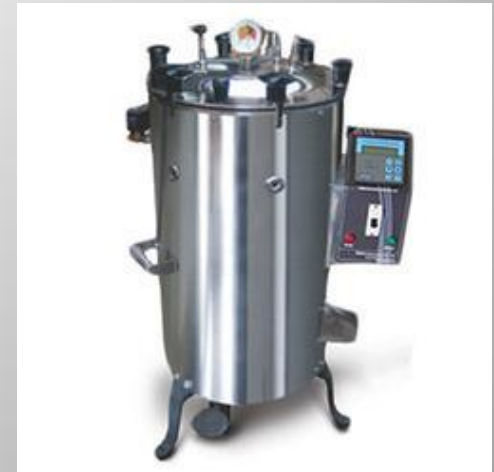
Laminar Air Flow