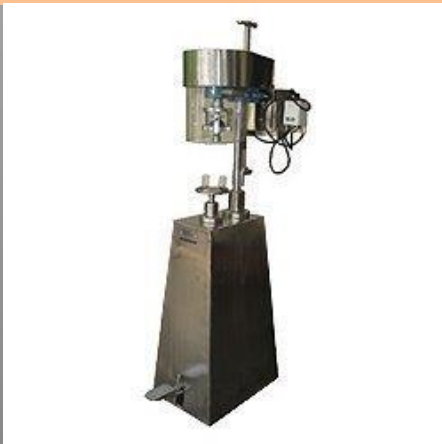
PP cap Sealing Machine