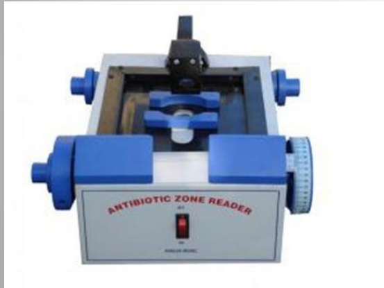
Antibiotic Zone Reader