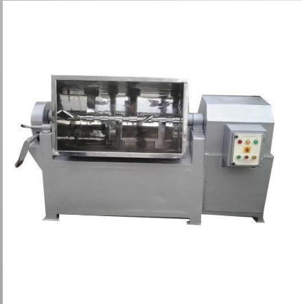
Stick Making Machine