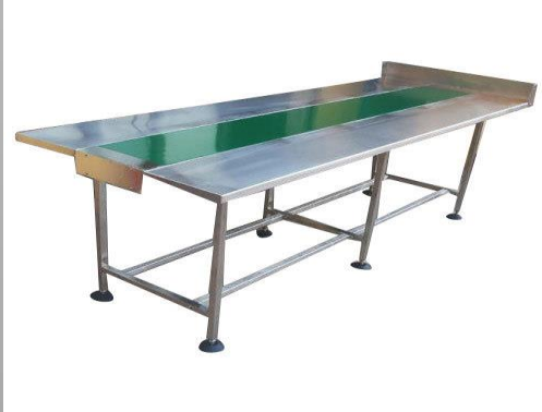
Packing conveyer Belt