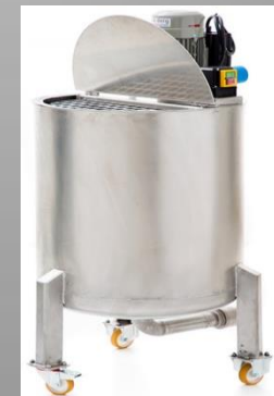
Stainless Steel Mixing / Storage Tank