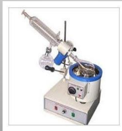
Rotary Vacuum Evaporator