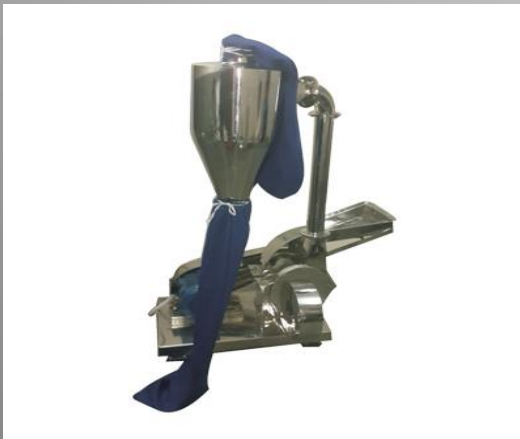
Cyclone Hammer Pulverizer