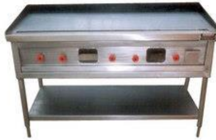
Dosa Plate / Griddle