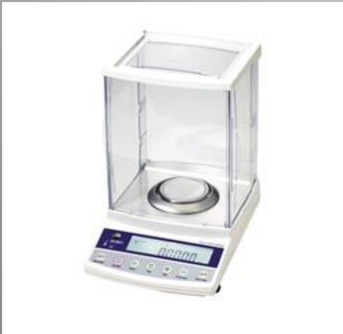
Analytical / Digital Balance