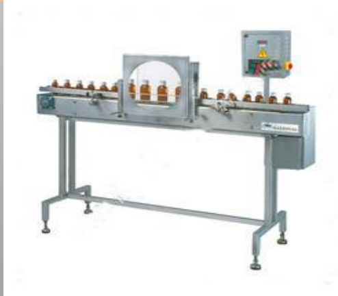
Bottle Inspection Table