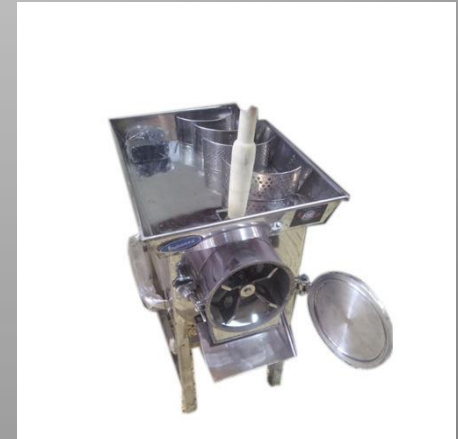
Mini Grinder Machine