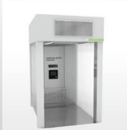
Powder Dispensing / Sampling Booth