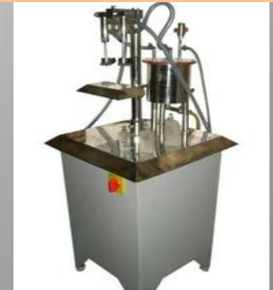
Vacuum filling Machine

Suitable for Filling All Sizes & Capacity