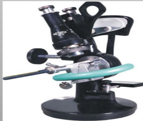
Refractro Meter/ Polari Meter